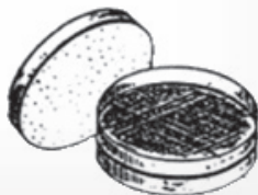
Short Term Test

Long Term Testing is conducted with alpha track and electret detectors for a period of more than 90 days. A long term test result can provide a better year round average than a short term test can provide.