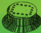
Long Term Test

If you have not tested your home for radon, go ahead and have a test performed. Proactive testing can save you and the potential buyer time during the possible sale of your home. Be sure the test is performed correctly and by a licensed individual.